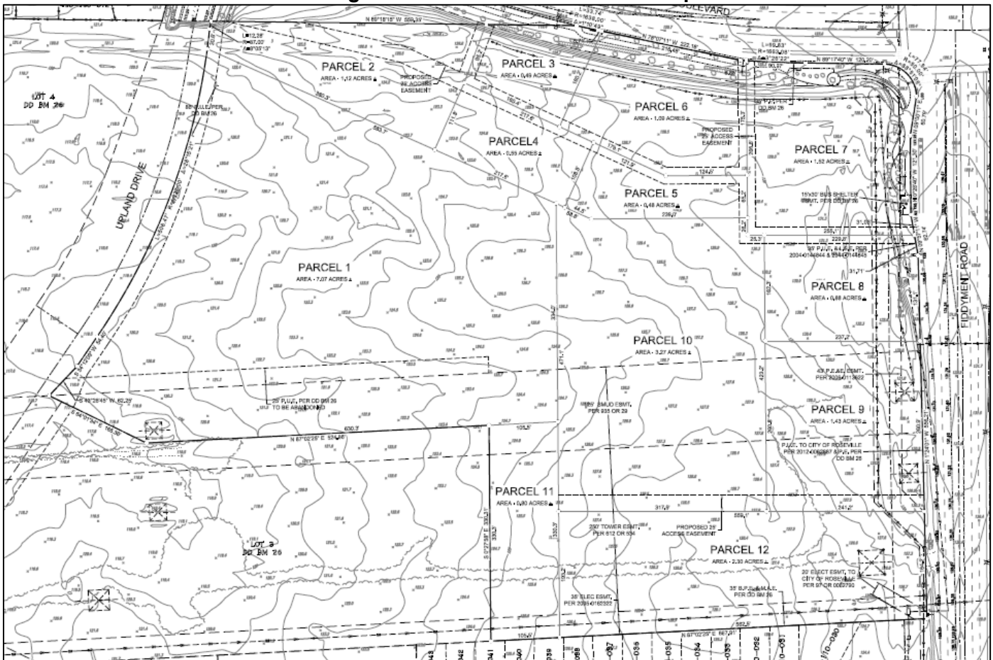
Figure 2 – Tentative Subdivision Map

The project request includes a General Plan Amendment, Specific Plan Amendment, and Rezone to adjust the boundary between HDR parcel JM-30 and CC parcel JM-41. This would convert 0.44 net acres from HDR land use to CC land use. The zoning designation would be modified to reflect the land use changes. The project also requests the third amendment of the Mourier and Computer Deductions Development Agreement (DA) to reflect the proposed changes. Finally, the project requests a Tentative Subdivision Map to create 12 parcels, which would divide large lot parcel JM-41 into 11 commercial parcels and reconfigure parcel JM-30 to align with the proposed land use changes.